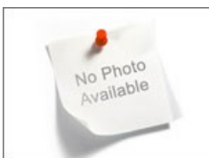
Few South County